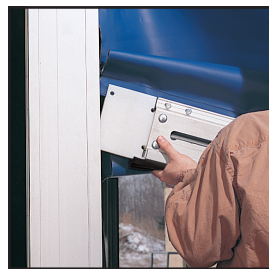
Easily resets, without the need for tools