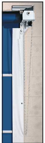
Manual Chain Hoist