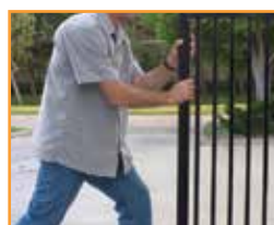
fail-safe release never be locked out (or in)